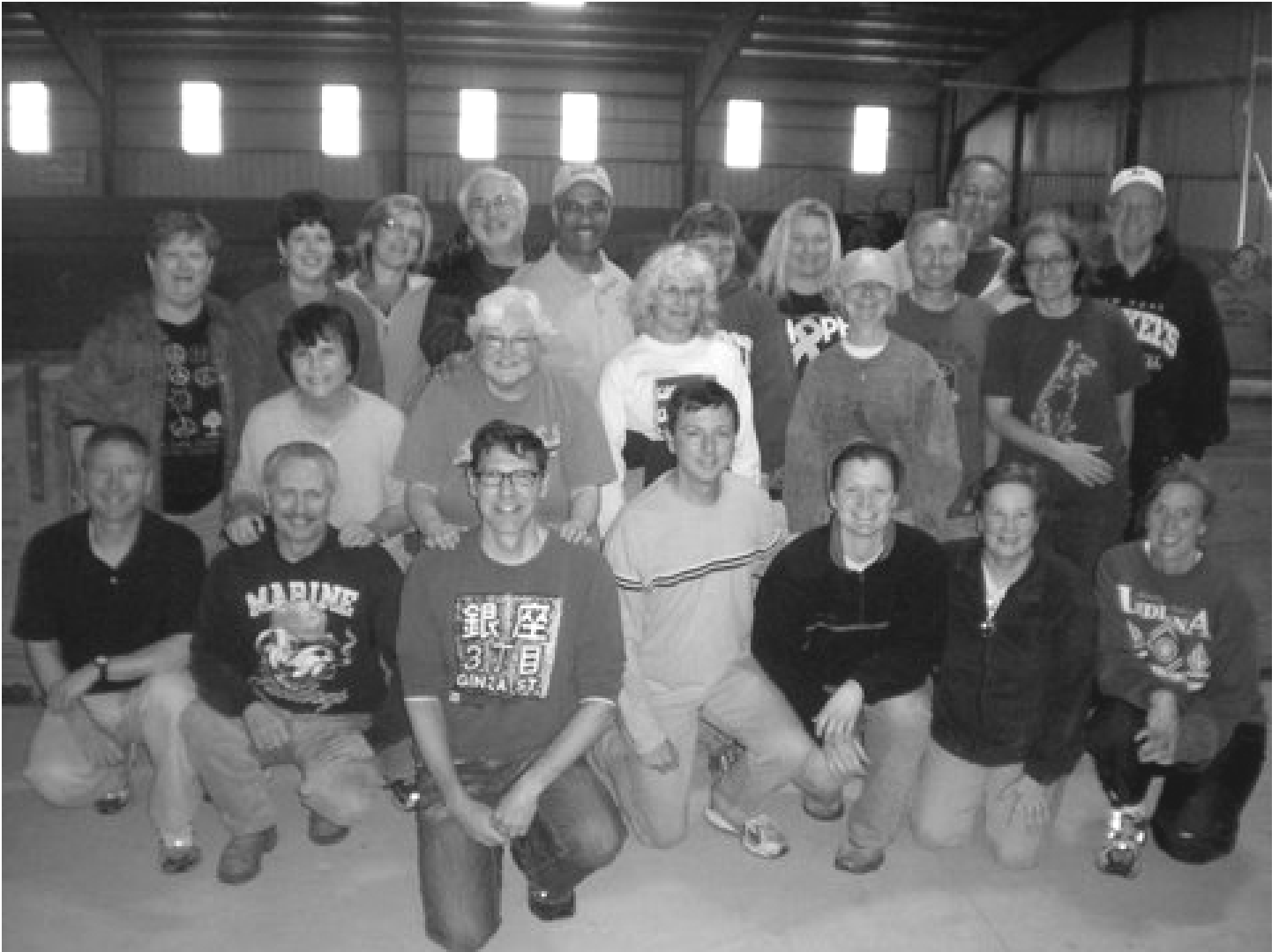
The OAM Magistrates at Vail Meadows equestrian riding center, Oregon, Ohio.